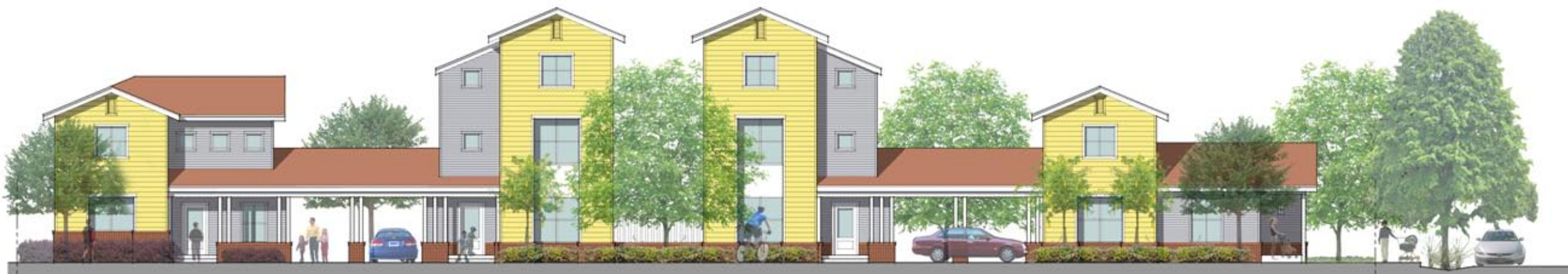
SHARED COURT ELEVATION