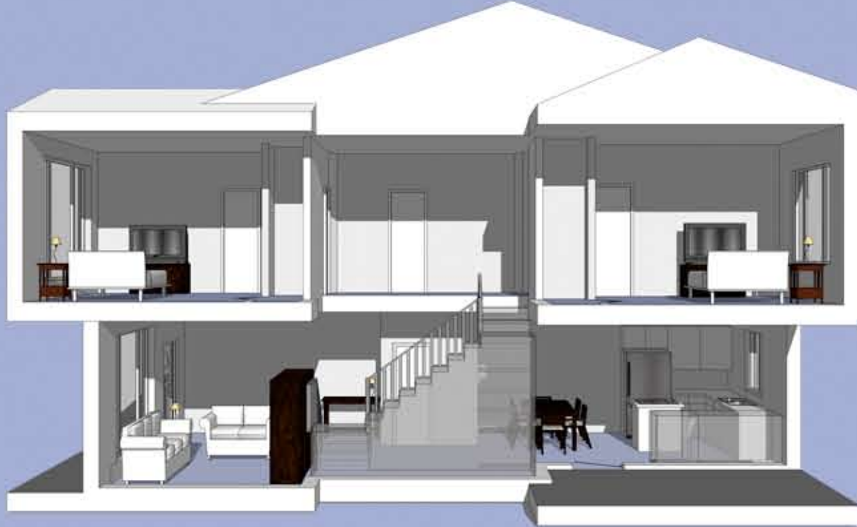
SECTION PERSPECTIVE: 2 STORY DESIGN