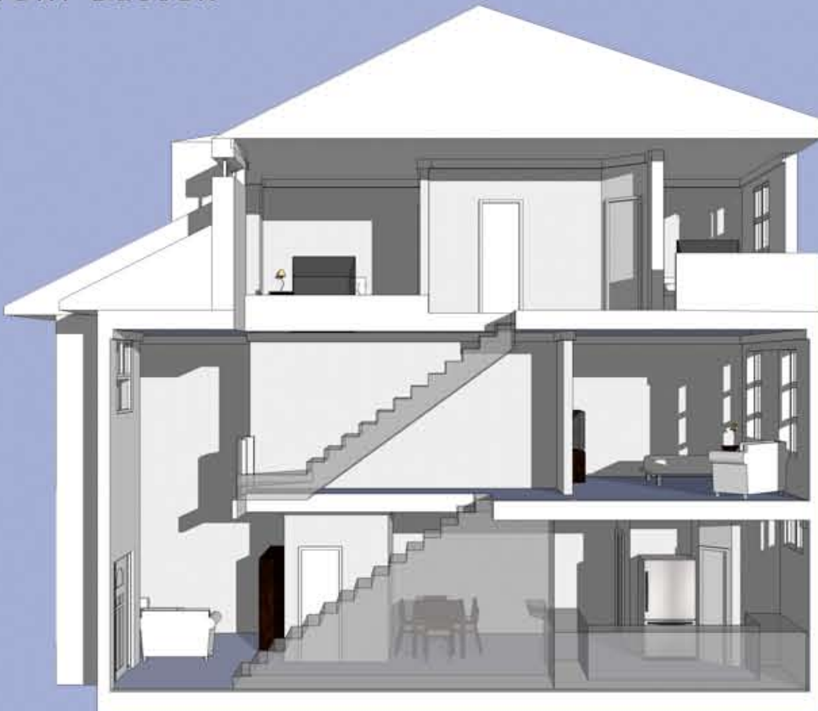
SECTION PERSPECTIVE: 3 STORY DESIGN