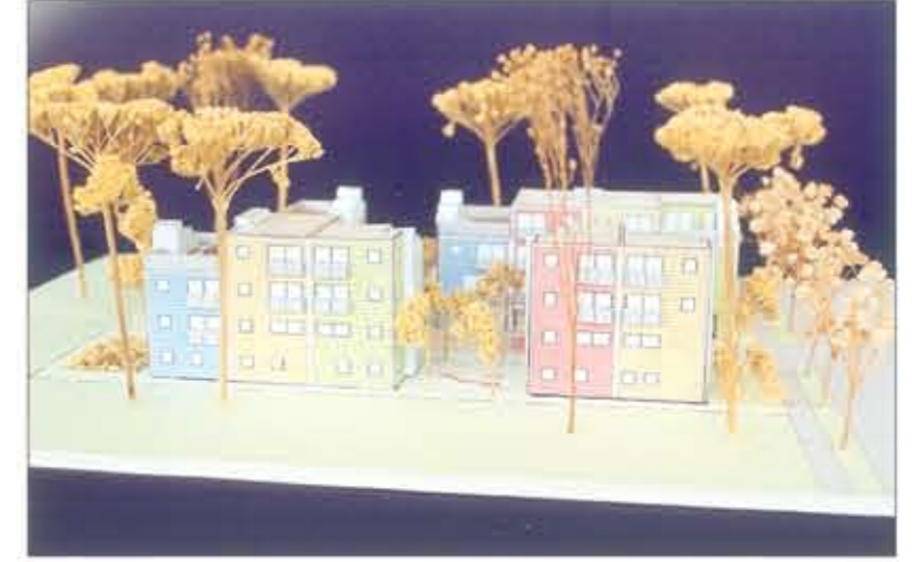
ADULTS + CHILDREN - SOUTH