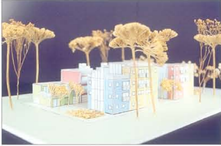
VEGETABLE GARDENS - WEST

* Note: Building coverage, including balconies, is 7,519 s.f.