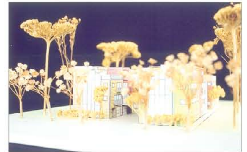
STREET ENTRY - EAST