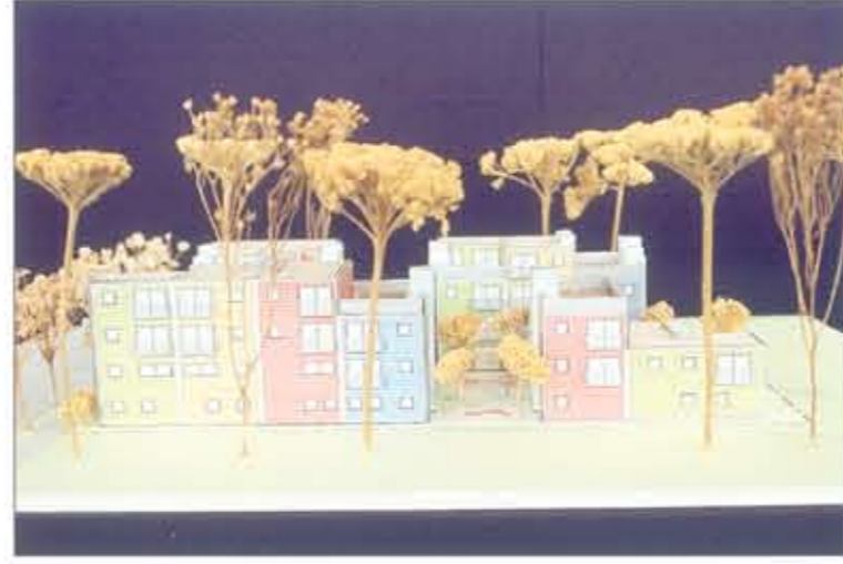
TOT LOT + ADULTS - NORTH