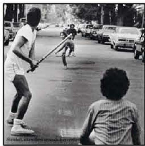
play - stickball