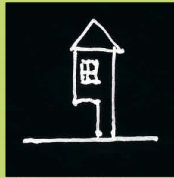
treading lightly - smaller building footprint