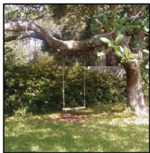
play - swing on the tree