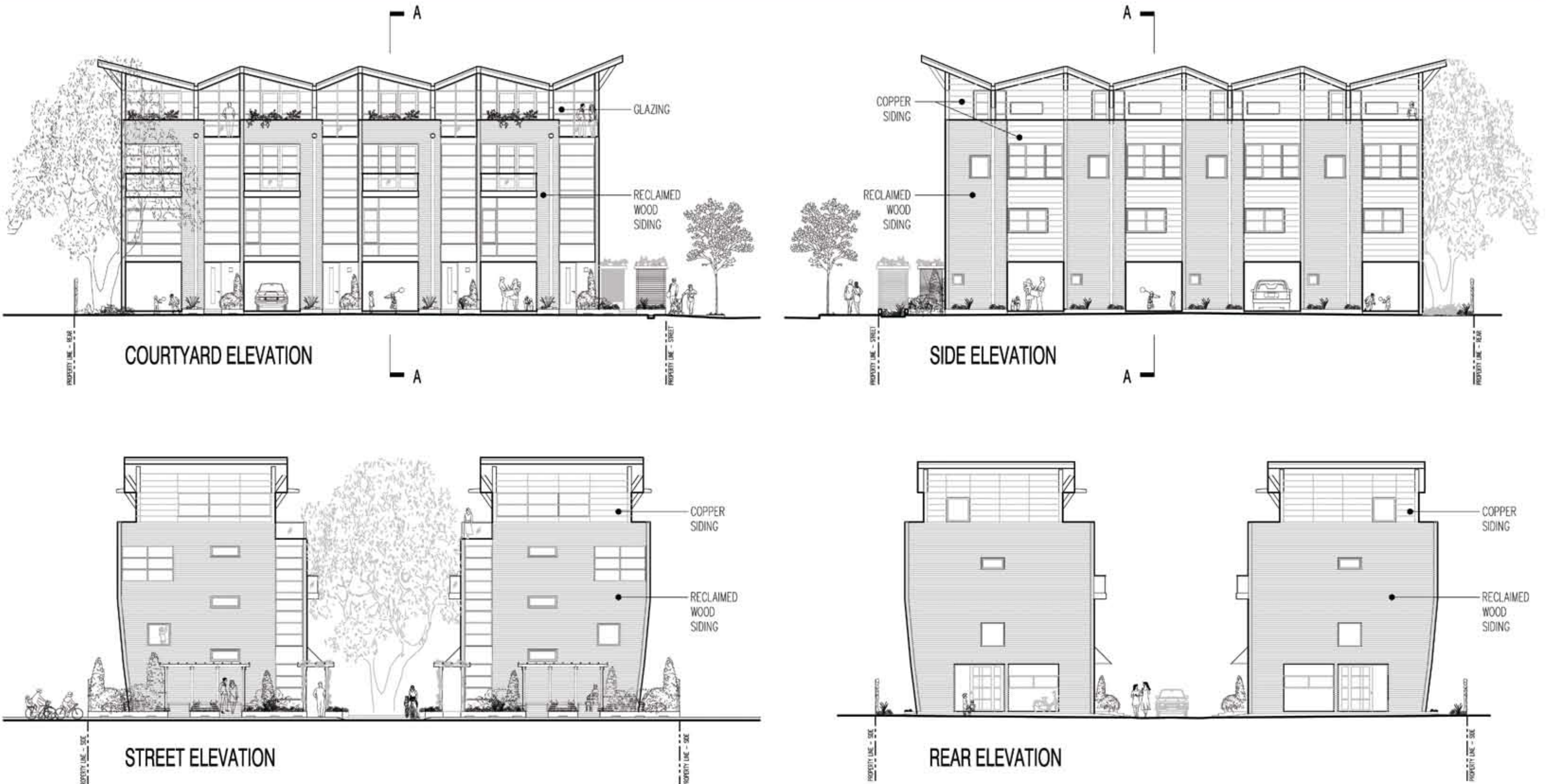
ELEVATIONS 1/16" = 1'-0"