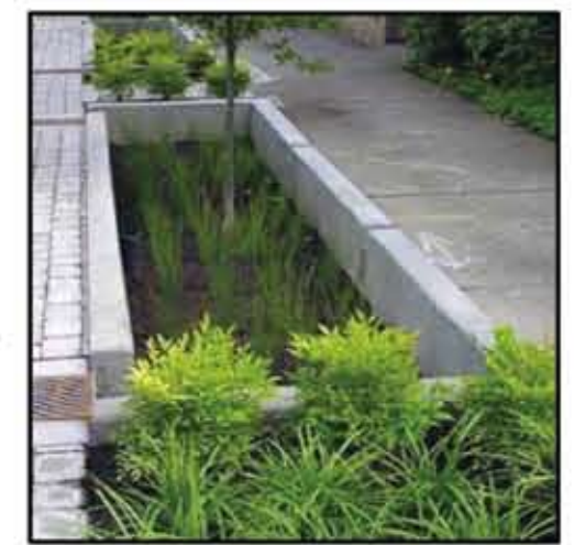
stormwater infiltration planters