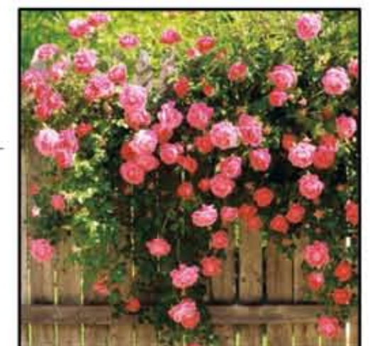
indigenous climbing roses on trellis and perimeter fencing