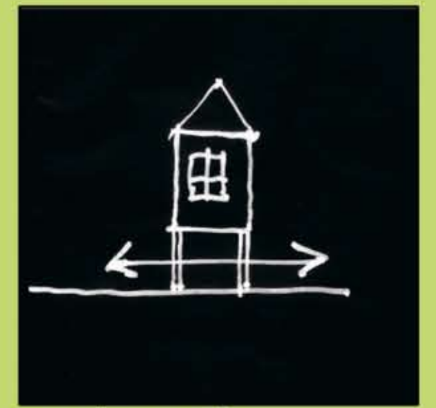
house on stilts - open space below