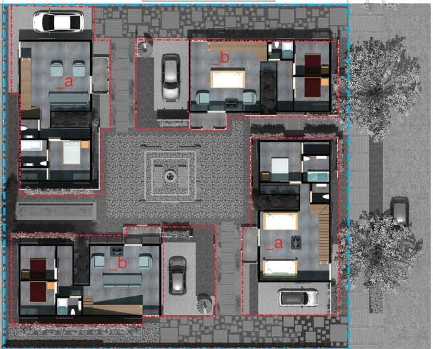
_1st floor plan | ownership