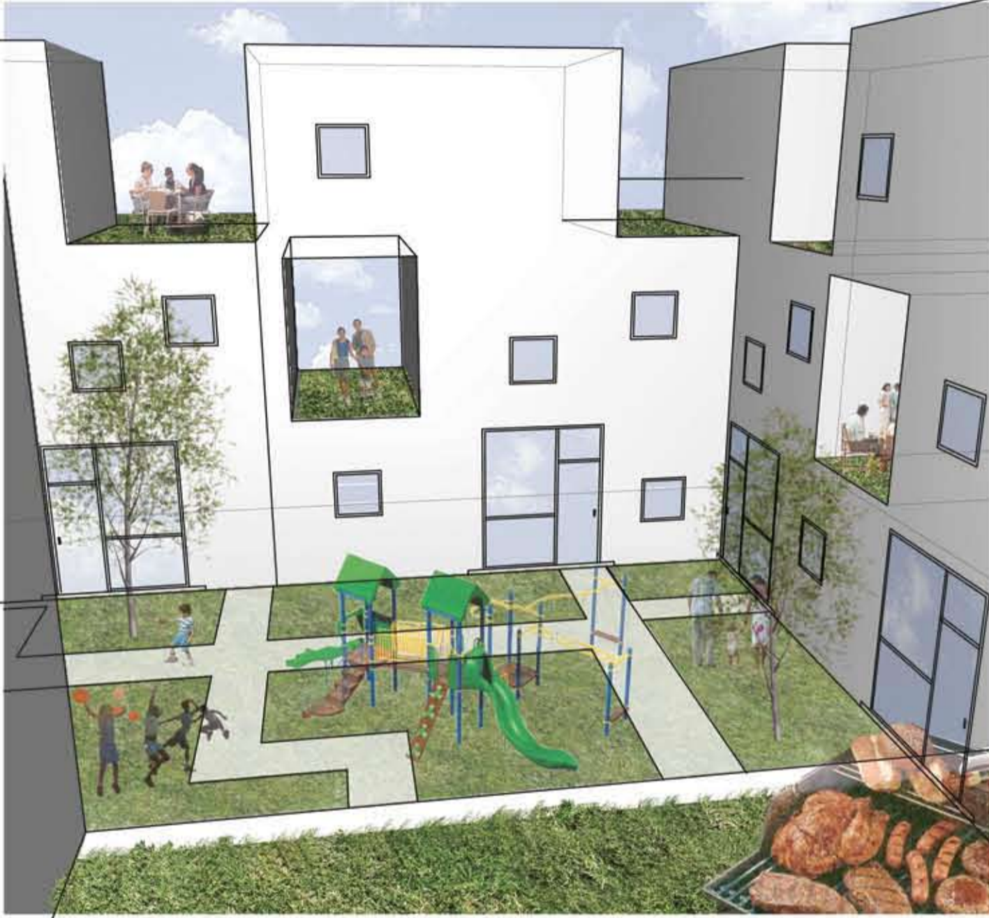
View from Rooftard to Shared Courtyard

The Portland Puzzle proposes a new housing prototype that promotes a healthy mix of public and private outdoor spaces. These work to engage the individual with the group, while allowing a strong identity within the community. A large community garden and playspace is bordered by small private yards and roof terraces. These work to extend the greenspace of the courtyard into and through the homes, promoting easy indoor-outdoor connections and providing visual links to the yards of neighboring single family homes. The slender 16' footprint of the houses allows an economical structure, while infusing the home with natural light and ventilation to help reduce energy consumption. The project would also utilize reflective roofing, local exterior materials, permeable paving and playground surfacing to further promote reduced environmental impact. The Puzzle provides 8 units ranging from 900 sf to 1850 sf, promoting a variety of family sizes and living accommodations ranging from 1 to 5 bedrooms. The total area covered is 4530 gsf, less than 50% of the site area, while the total built area is 12,540 gsf.