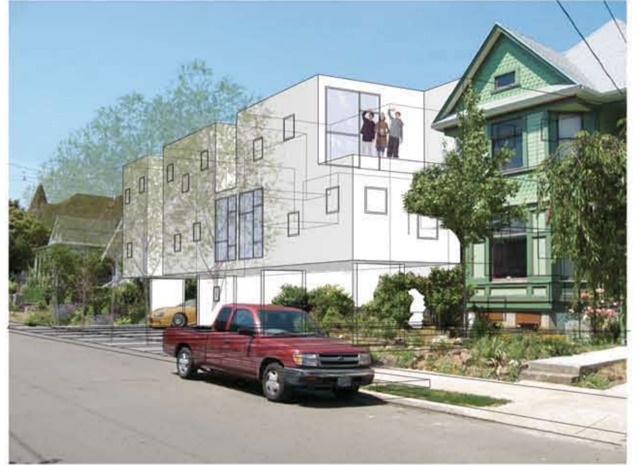
View from Street