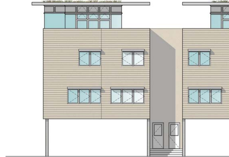
South Elevation 1/16" = 1'-0"