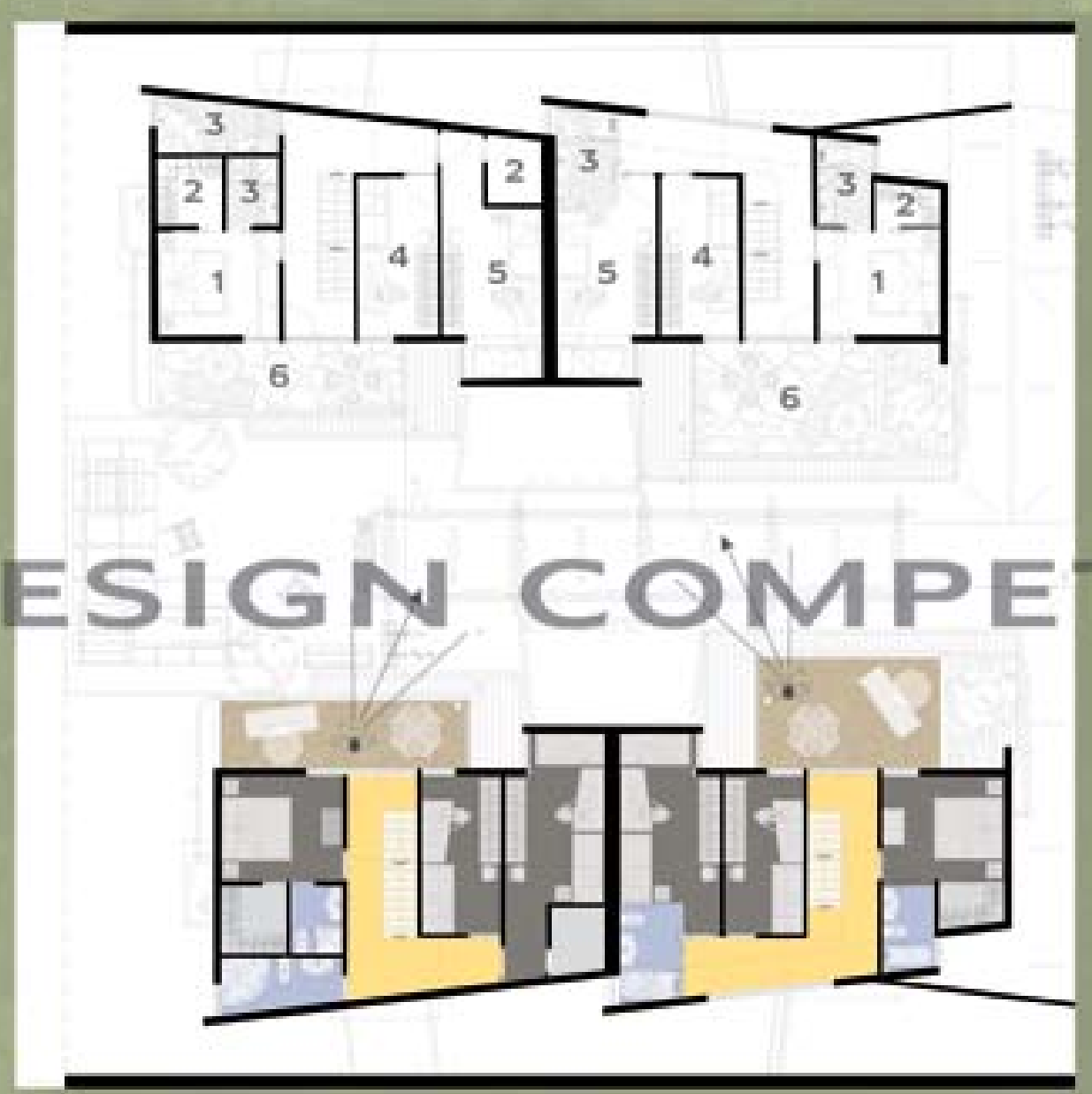
second floor plan