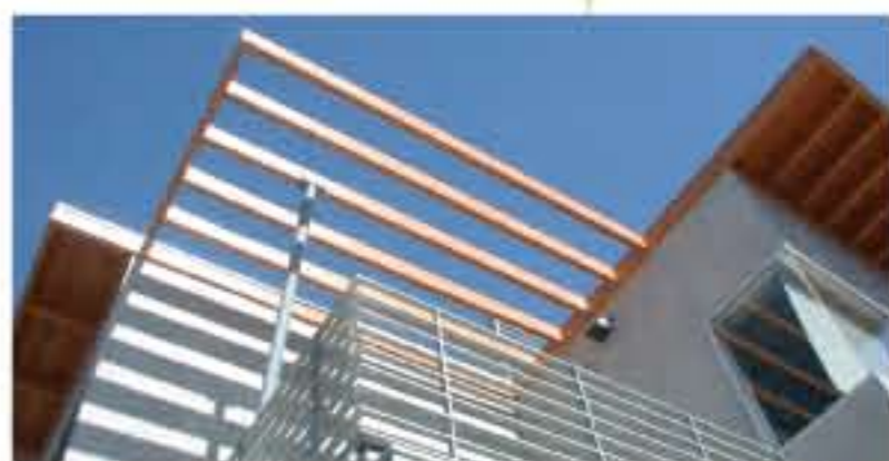
Trellis + Eaves