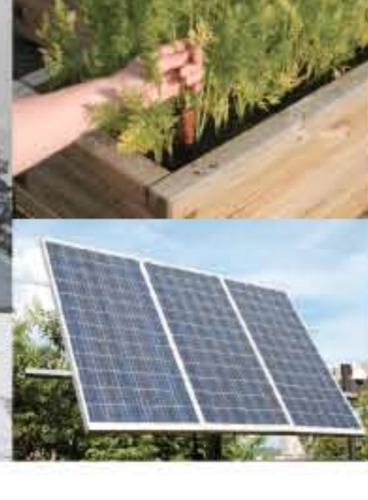
Roof Top Garden Planter