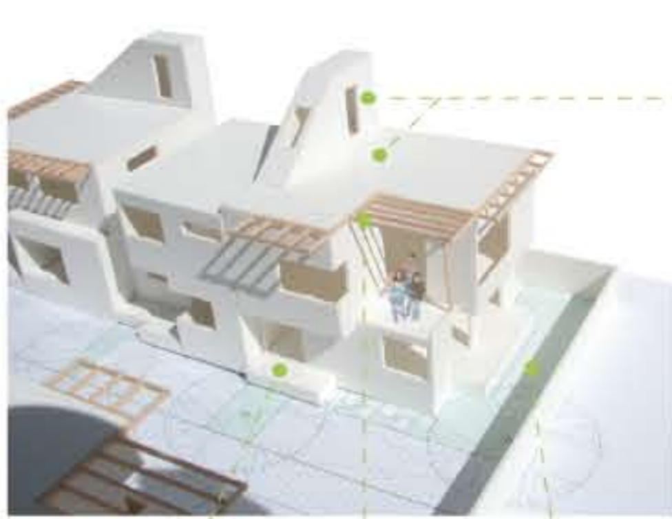
porch — yard

Subdivision into small lots to maintain Fee Simple Ownership in order to limit liability and subsequently costs.