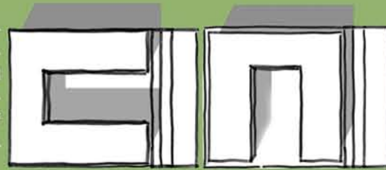
Typical Courtyard Layout A: Pedestrian Access to Courtyard